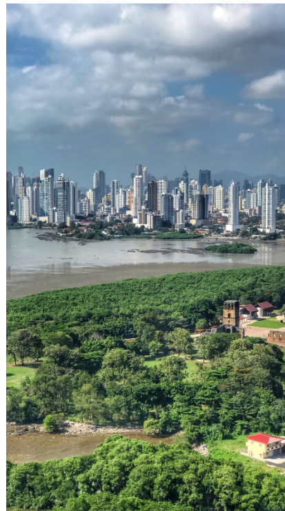
FIGURE 1. PANAMA CITY BEHIND MANGROVE AREA. CREDIT: FRANKLIN CANELON, UNSPLASH, JUNE 2019.

A methodology for classifying landcover into forest and nonforest was developed using Random Forest, a decision tree-based classification approach. The algorithm runs with optical and synthetic aperture radar (SAR) data in addition to ancillary data such as the Normalized Difference Vegetation Index (NDVI), slope, and elevation. Yearly composites were created from SAR data and cloud-free optical data to generate forest/non-forest (FNF) classifications. The results were validated using a reference landcover map generated by the Ministry of the Environment of Panama.