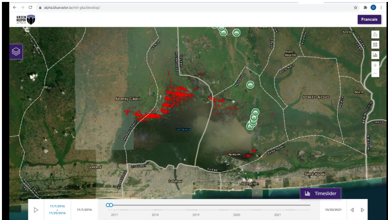
FIGURE 2. THE PROJECT CREATES A NEW ONLINE OBSERVATORY THAT WILL BE USED BY GREEN KEEPER AFRICA TO HOST OBSERVATIONS OF WATER HYACINTH IN SOUTHERN BENIN. THE OBSERVATORY IS DESIGNED BY THE BLUE RASTER COMPANY WITH GUIDANCE FROM THE MIT TEAM TO SHOW INFORMATION FROM SATELLITES, DROWN AND IN-SITU WATER SENSORS THAT INFORM THE MANAGEMENT OF WATER HYACINTH.

visits of government-managed forests to learn how CENATEL already uses satellite-based earth observation data and positioning services to perform surveys and apply for management policies. Researcher Abigail Barenblitt of NASA GSFC provided CENATEL with training on how to use Google Earth Engine for cloud-based analysis of satellite data. Through the project, the CENATEL teams aims to compare their standard methods for performing forest inventory with field surveys with recently available methods that apply high resolution data to train machine learning algorithms and improve the classification using medium resolution data.