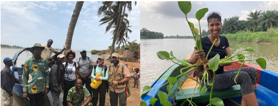
FIGURE 1. THE US-BASED PROJECT TEAM HAS VISITED BENIN TO PERFORM FIELD WORK WITH GREEN KEEPER AFRICA AND THE NATIONAL REMOTE SENSING OFFICE IN BENIN REGULARLY SINCE 2018. DURING THE FIELD VISITS, THE TEAM LEARNS ABOUT THE LOCAL CONTEXT FROM THE BENINESE COLLABORATORS. THEY ALSO COLLECTS DATA USING INTERVIEWS DRONES, MOBILE PHONES AND WATER SENSORS TO IMPROVE THE INTERPRETATION OF SATELLITE DATA.

Local companies and scientists in Benin are increasing their use of earth science information to manage forests and water resources. The invasive water hyacinth plant grows aggressively in Benin and many countries in Africa, harming local activities in fishing, transportation and trade. The Beninese company Green Keeper Africa creates a business that brings jobs and environmental restoration by harvesting the water hyacinth and converting it into a product that can absorb oil-based pollution. Meanwhile scientists at the national remote sensing office are using satellite data to map mangroves and government-managed forests while reducing risks for illegal deforestation and fires.