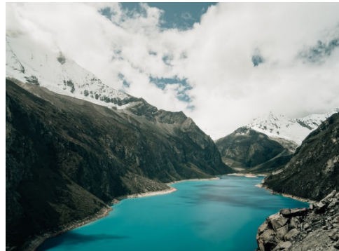
FIGURE 1. LEFT: ECUADOR LANDSCAPE; RIGHT: PARON LAKE, PERU.